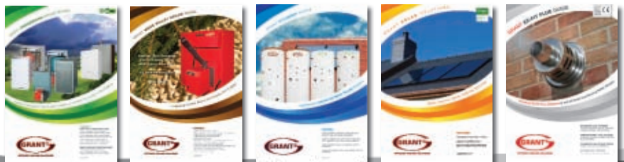
Condensing Boilers Wood Pellet Boilers Cylinders Solar Thermal Water Heating Systems EZ-Fit Flue Systems