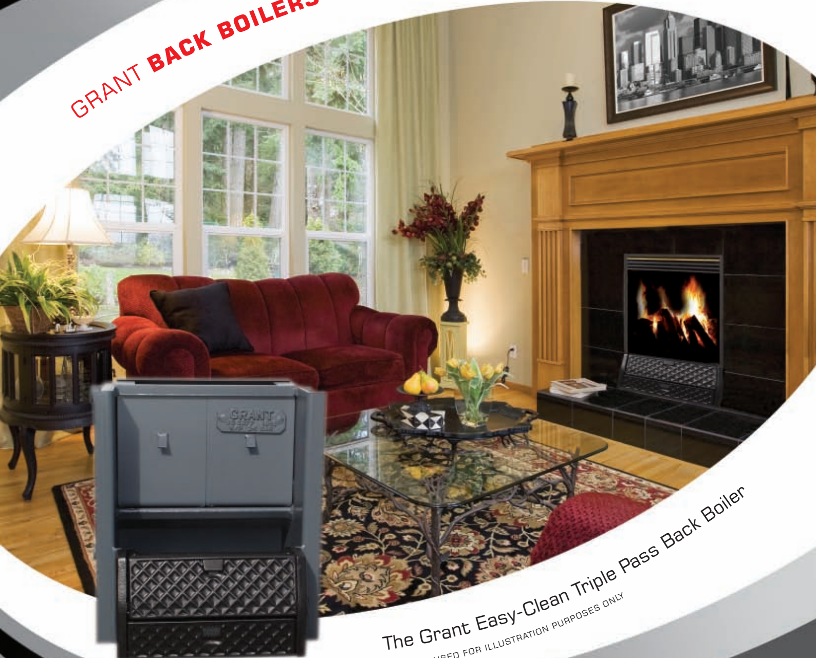
The Grant Easy-Clean Triple Pass Back Boiler *IMAGES USED FOR ILLUSTRATION PURPOSES ONLY